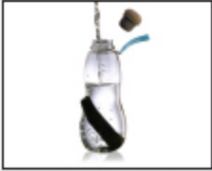
-Eau Good, Black-Blum