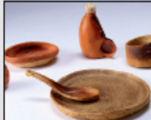
-Peels, Solskin Design -Cookie Cup, Sardi Innovation