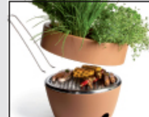
-Hot Pot Bbq, Black-Blum -Life, Andrea Ponti Design