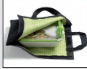
-Torro, Hakan Gürsu -Box Appetit Bag, Black-Blum