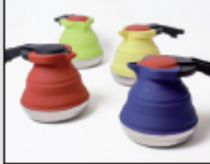
-Reflex, Vapur -Slickboil, Cuissential